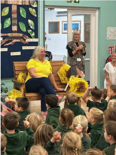
We might not have a throne, but the guest of honour was put in the hot seat!