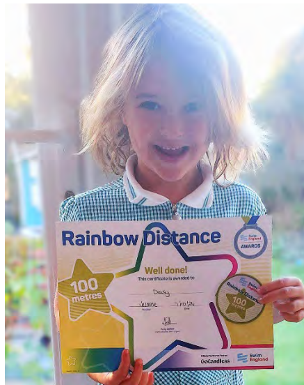
Daisy has been awarded her 100m swimming badge! Well done Daisy – keep it up!